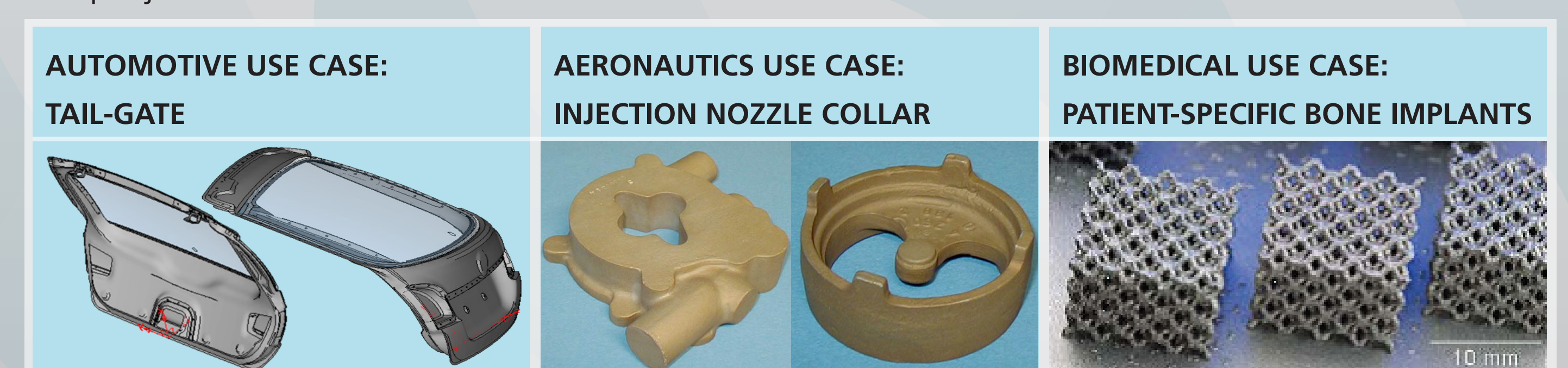
Fig.2: Representative Potential Applications

Three Use Cases (Fig.2) have been defined in order to obtain suitable alloy properties, and ensure that representative future applications are developed for its commercialization after the project.