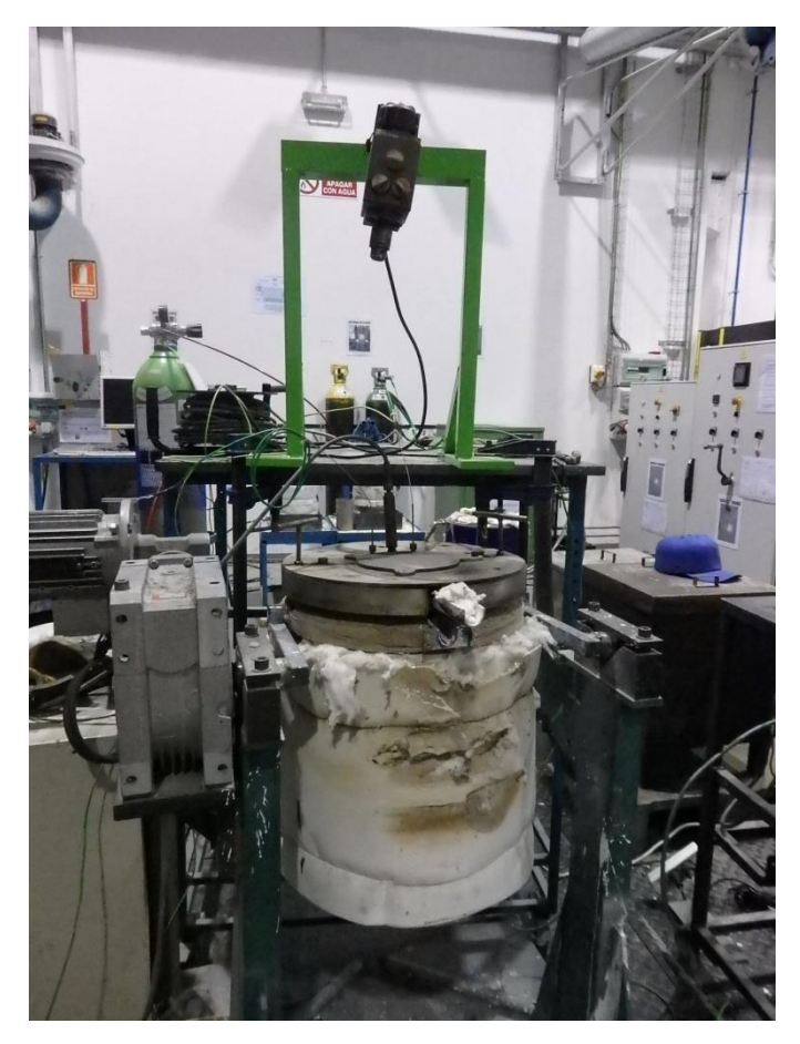
Recycling test unit