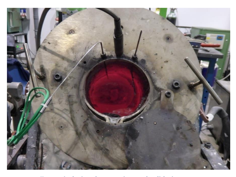
Test unit during the experimental validation test